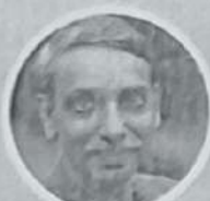
Prof. M. Jagadesh Kumar Chairman, UGC

National Education Policy (2020) - The Broad Contours