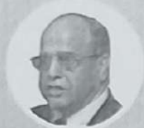
Padma Vibhushan Dr. K. Kasturirangan Chairman, National Education Policy -2020

National Education Policy (2020) - The Broad Contours